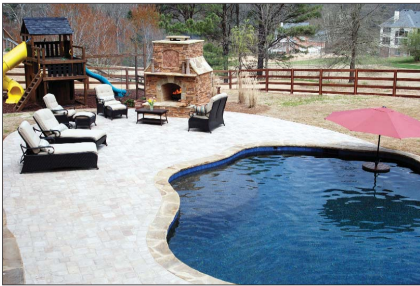
Above: The Samuels' backyard upgrades included the installation of a swimming pool with waterfall features and a spa surrounded by custom stonework, a fireplace and seating area and an under-deck area with a flat-screen TV. Below: HGTV videographer Brian Till of Denver films the pool.

The upgrade included the installation of a swimming pool with two waterfall features and a spa, a stacked stone fireplace with a seating area for six and an under-deck area, with a flat-screen television and surround-sound system, a ceiling fan and flagstone. The